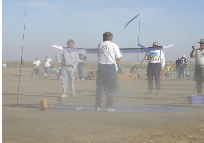
FIGURE 1. Persons attending the world championship of model airplane flying — Lost Hills, California, October 2001