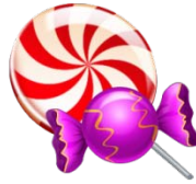
Less candy and junk food