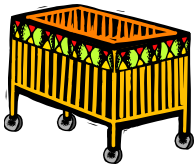
No bottle in bed