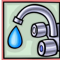
Drink tap water