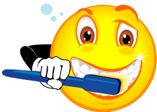
Brush twice daily with fluoride toothpaste