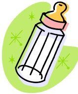
Wean off bottle