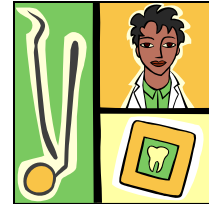
Regular dental visits for child