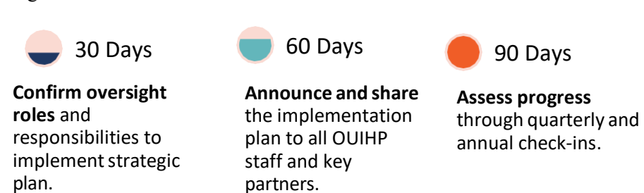
Figure 2. OUIHP 90-day launch plan

The establishment of internal protocols for monitoring implementation of the 2022-2026 OUIHP Strategic Plan in the first few months is a critical time. The first step is to determine implementation oversight responsibilities, which includes promoting the plan and/or identifying champions to promote the plan. In the first 90-days, specific steps provide orientation to the 2022-2026 OUIHP Strategic Plan and communicate the roles of OUIHP staff and partners. It also provides a calendar for establishing regular check-ins and reporting of progress. Figure 2 summarizes the 90-day launch plan for the 2022-2026 OUIHP Strategic Plan.