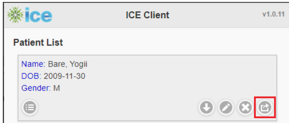
Figure 6-1: ICE test website