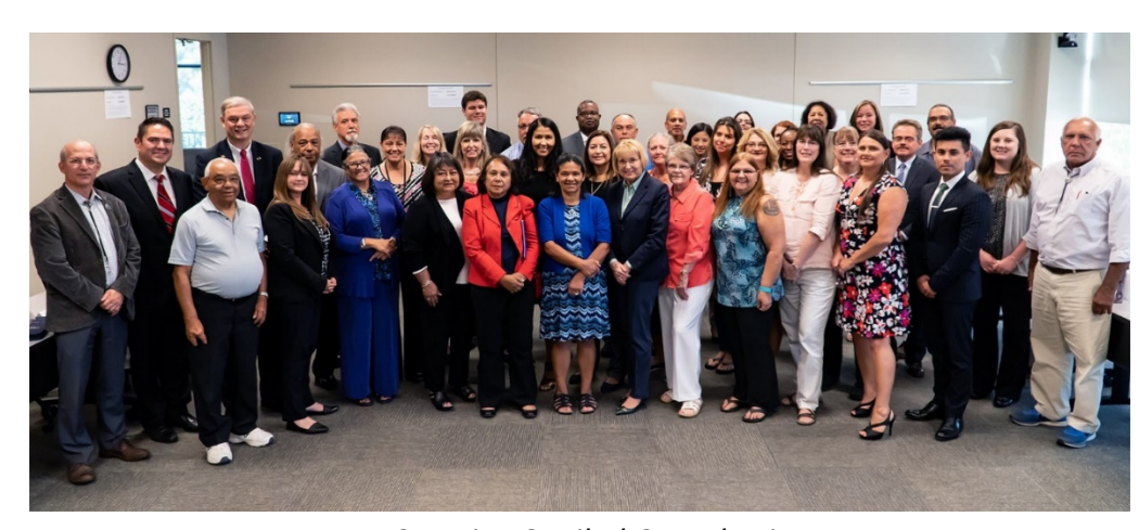
HHS Region 3 Tribal Consultation