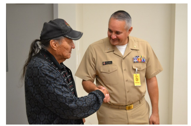
Rear Adm. Weahkee visits the Youth Regional Treatment Center