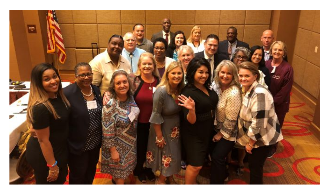
HHS Region 4 Tribal Consultation Meeting