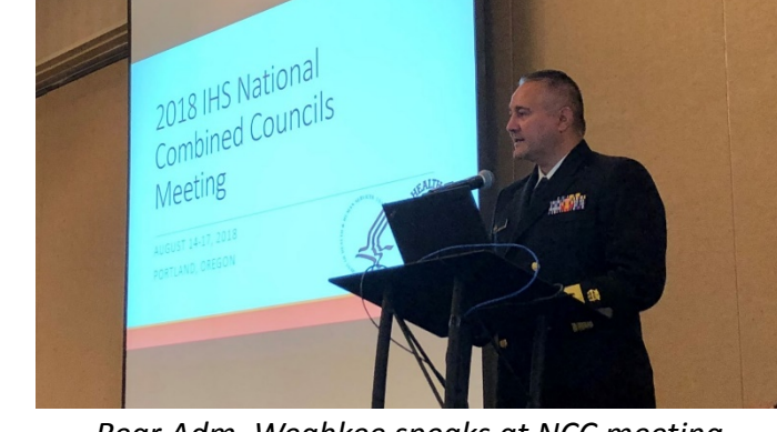
Rear Adm. Weahkee speaks at NCC meeting