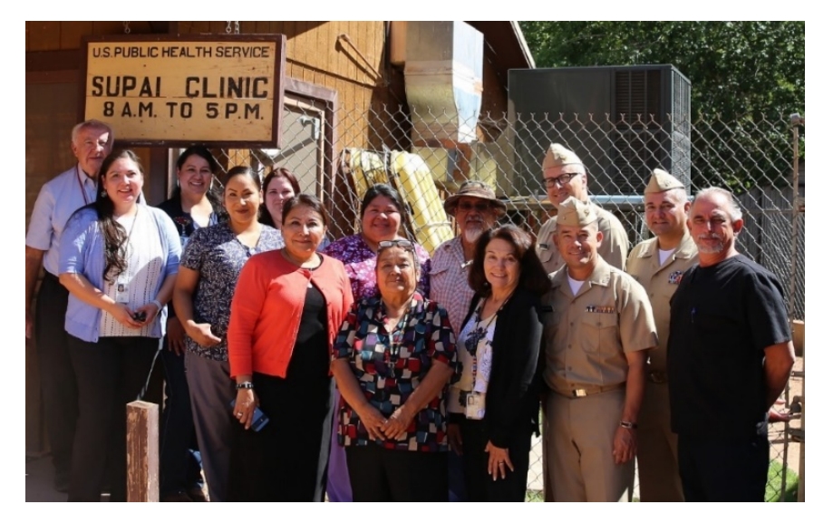
Supai Health Station