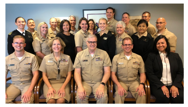
HOPE Committee Meeting