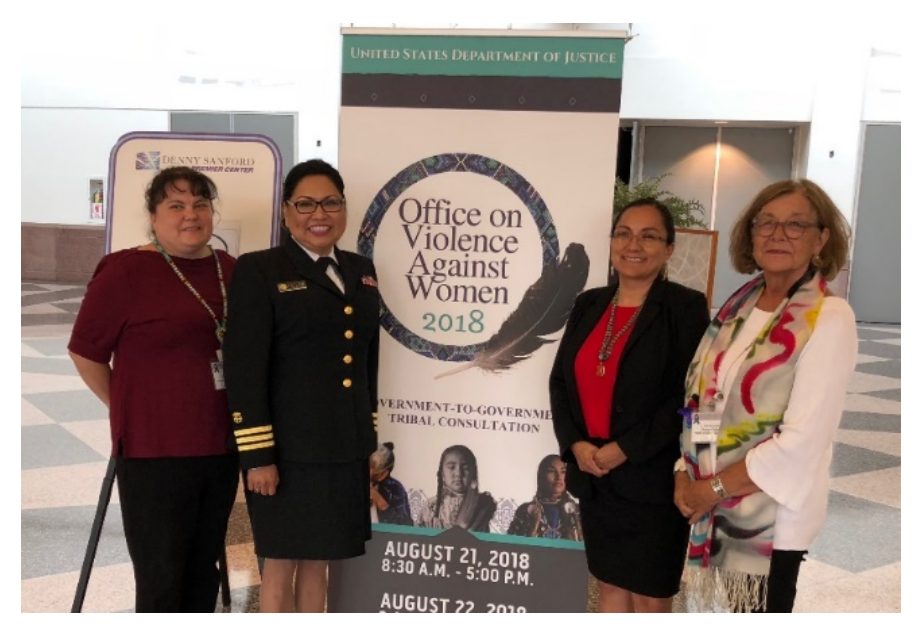
Violence Against Women Tribal Consultation