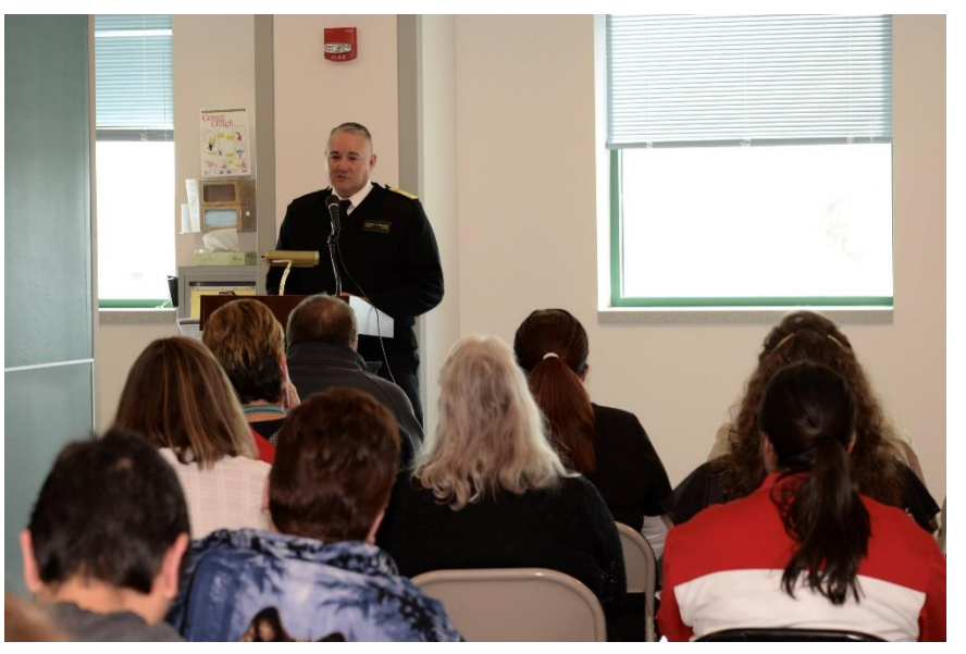
Rear Adm. Weahkee speaks with Pine Ridge Hospital staff in South Dakota, March 27