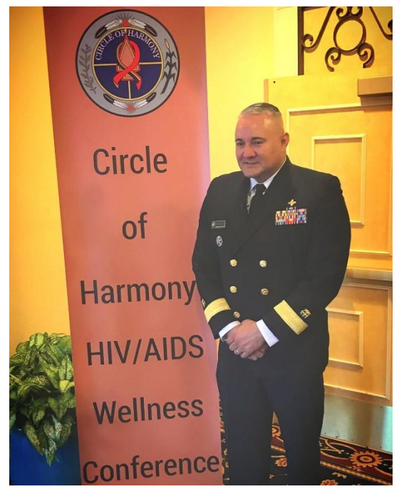
2019 Circle of Harmony HIV/AIDS Wellness Conference in Albuquerque, New Mexico