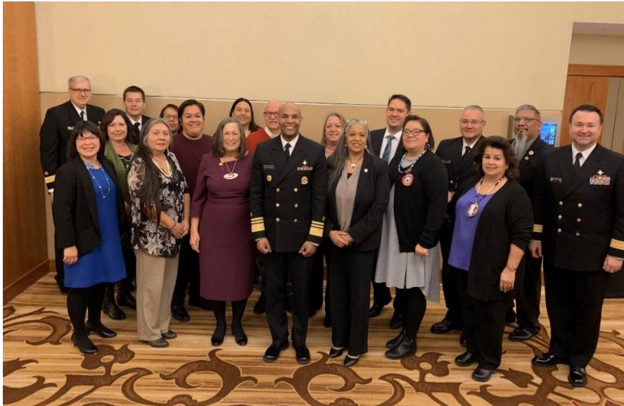
U.S. Surgeon General, Vice Adm. Jerome Adams, MD meets with IHS leaders and TSGAC members