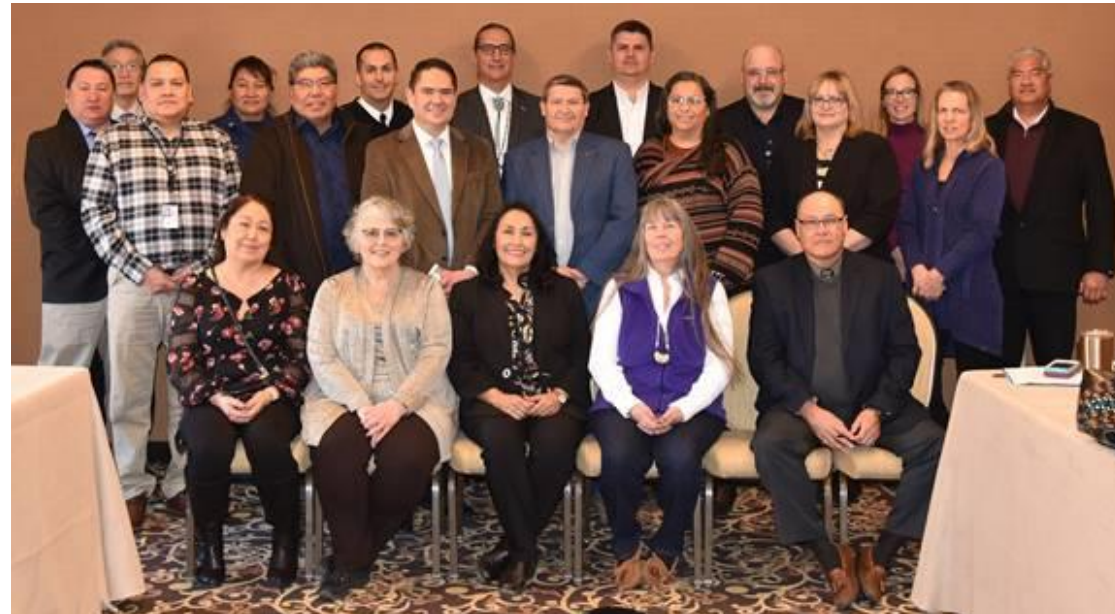
Meeting with the Little Shell Tribe of Chippewa Indians