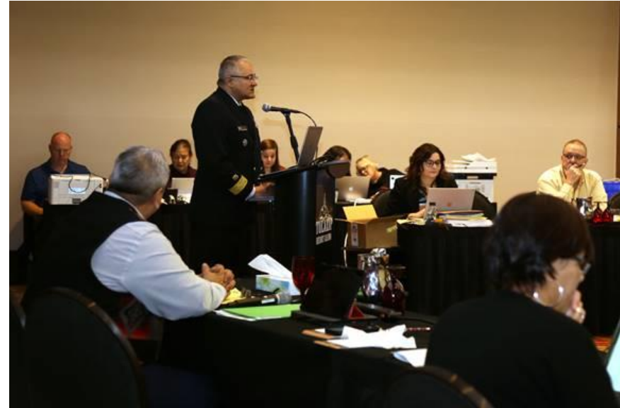
Northwest Portland Area Indian Health Board quarterly board meeting