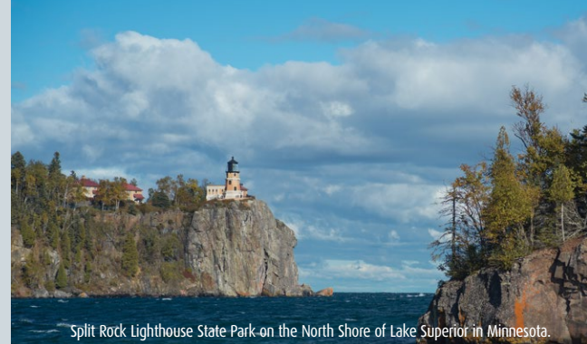
Split Rock Lighthouse State Park on the North Shore of Lake Superior in Minnesota.