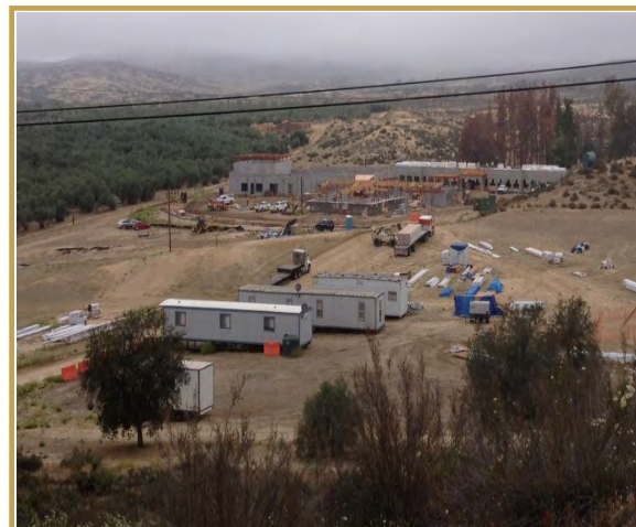
Above: Desert Sage Youth Wellness Center, Under Construction, Hemet, CA

DHFE assists with tribal planning efforts for site selection and develops facility criteria