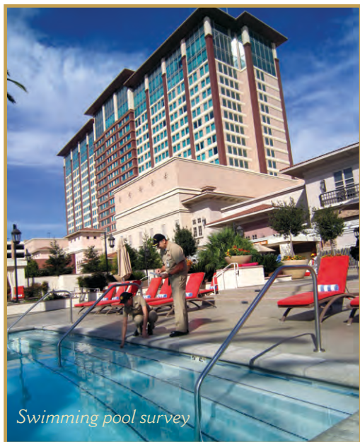
Swimming pool survey

Environmental health capacity in communities is built through funding and coordinating environmental health-related trainings. These courses are intended to increase the tribe's ability to address community environmental health issues.