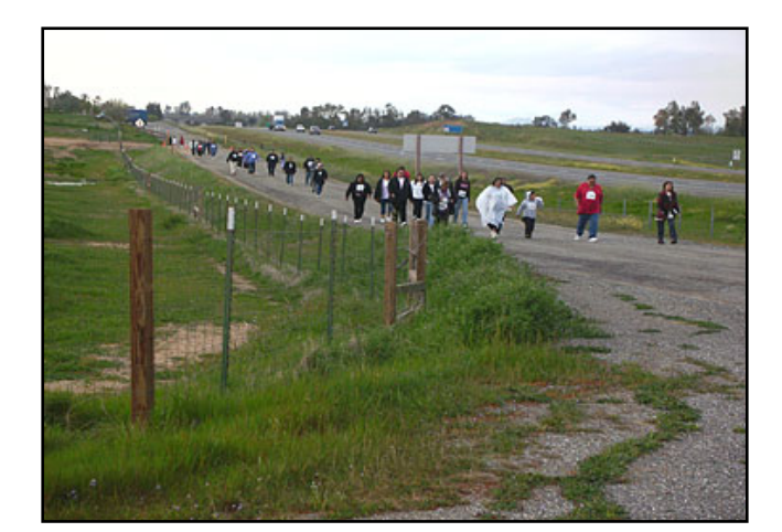
Fun Run/Walk at the Tribal Leaders Conference 2008

The concept of balance is core to traditional views of health. This includes understanding mind, body, and spirit, and having a sense of well-being. Many traditional teachings emphasize maintaining wellness, rather than treating illnesses or problems. These concepts have served communities well throughout time, helping Native people survive many challenges. Even in tough times, bringing people together around wellness can help them move in a positive direction together. It can help them identify their own resources, and use the knowledge and ability of community members to promote change. This can include working with groups and individuals to develop a vision of community wellness, and decide on changes that will create community owned wellness. For example, while knowing that injuries are a leading cause of death among Native people, it is also important to recognize the valuable elements of healing among Native people. For example, car crashes may be a result of drinking, but can also be due to poor road conditions, or the lack of stop signs at busy intersections. By working together, communities can identify how to best address social and environmental conditions that impact wellness from their viewpoint. Community-owned wellness looks