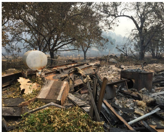
Home destroyed in Upper Lake 2018