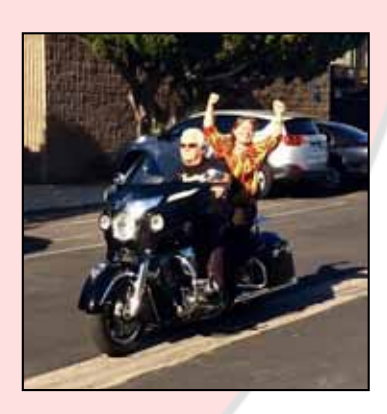
Our Director of Behavioral Health having fun!