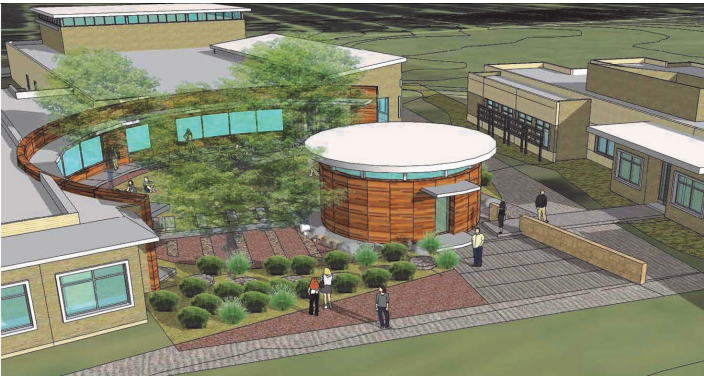
Southern YRTC design of southeast courtyard

The Indian Health Service/California Area Office is planning to establish two YRTCs in California. The YRTCs will provide inpatient treatment for chemical dependence for eligible American Indian and Alaska Native youth, ages 12-17. On January 8, the IHS accepted title to the site for the Northern California YRTC. The 12 acre site is approximately 6 miles west of Davis, in Yolo County. In October 2012, IHS Headquarters, in collaboration between the Area Office and an architectural firm, began designing the Southern California YRTC, which will be located in Riverside County, near the town of Hemet. We are halfway through the design-phase, and the Area Office will continue to seek advice and recommendations from California's Tribal governments. See below for the architect's preliminary sketch of the facility.