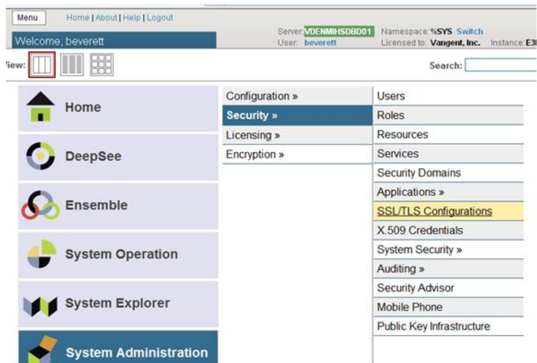
Figure 5-1: Navigate to the SSL/TLS Configurations screen