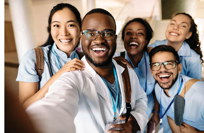
Photo right: Young health professionals are attracted to the financial freedom of the IHS LRP.

Our Mission: to raise the physical, mental, social and spiritual health of American Indians and Alaska Natives to the highest level.