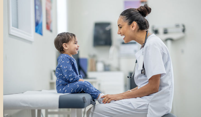
Photo Left: Sun setting on sail boats on Lake Calhoun in Minneapolis. Right photos top to bottom: Toddler and doctor interact during a routine check-up, kayaker at the Pictured Rocks National Lake shore on Lake Superior in Michigan's Upper Peninsula and dental team with a young patient.

As a resident of this spectacular five-state Area, you'll marvel at the miles of sparkling lakes, tall pines and Midwest hospitality. You'll also find a world of opportunities for professional enrichment and recreational pursuits.