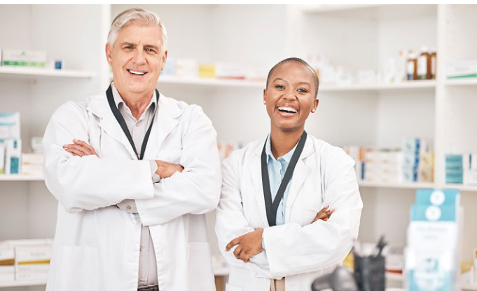
Photo Left: A young American Indian girl on an exam table while a nurse listens to her heart, a team of health professionals posing for the camera, two pharmacists smiling for the camera.