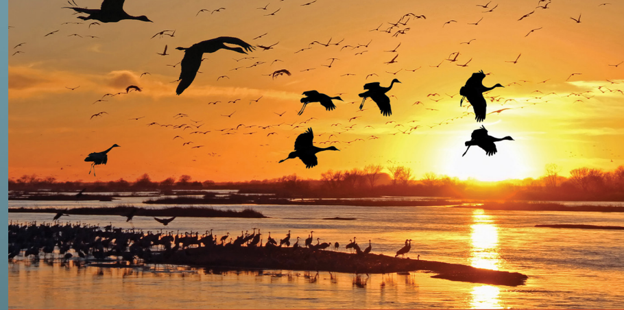
Photo Right: Migrating sandhill cranes along the Platte River at sunset in Nebraska.