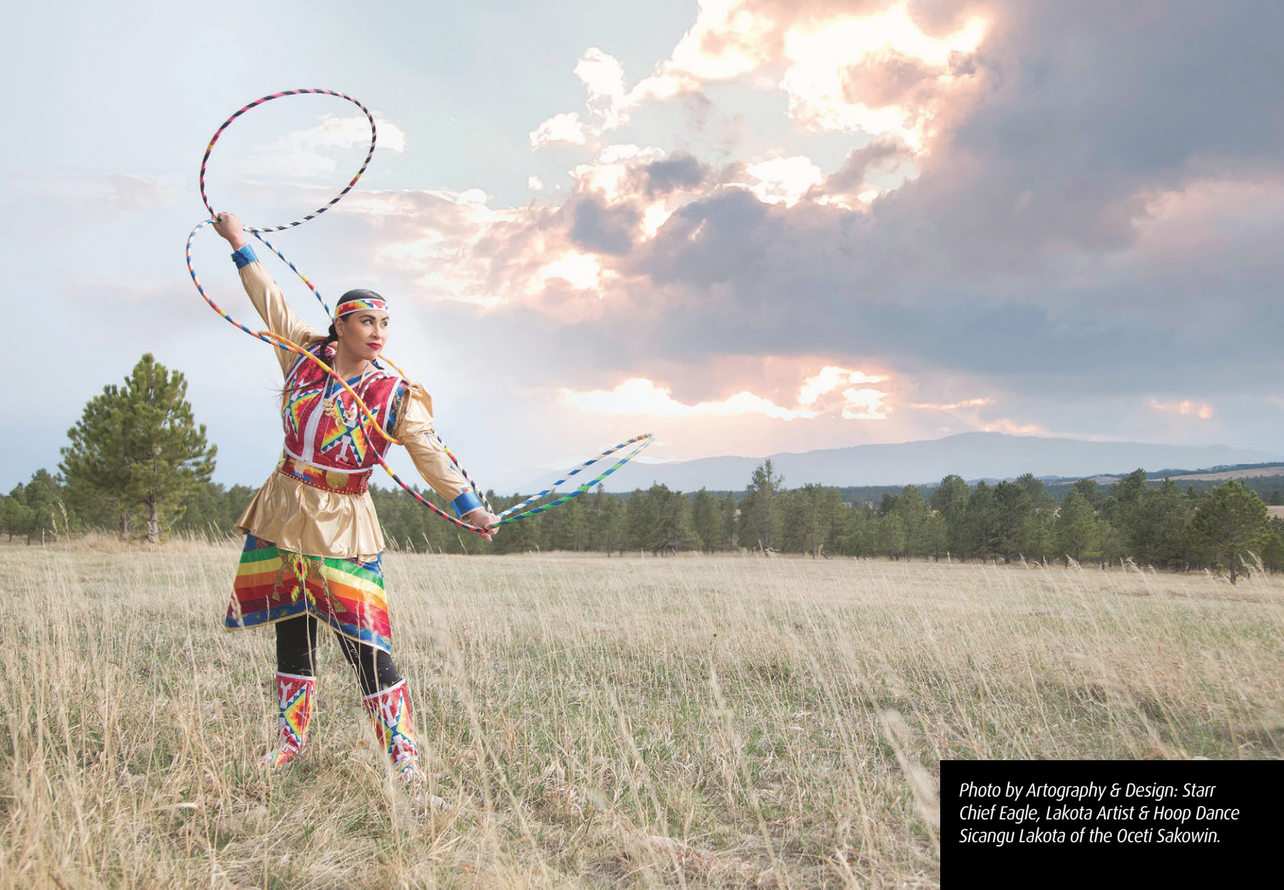
Starr Chief Eagle, Lakota Artist & Hoop Dance Sicangu Lakota of the Oceti Sakowin.