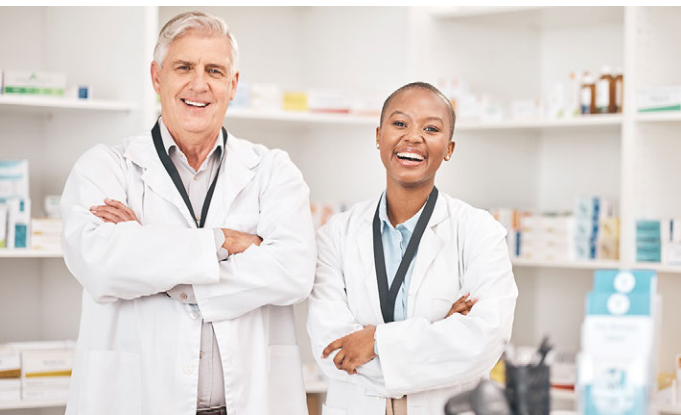
Photo Left: A young American Indian girl on an exam table while a nurse listens to her heart, a team of health professionals posing for the camera, two pharmacists smiling for the camera.