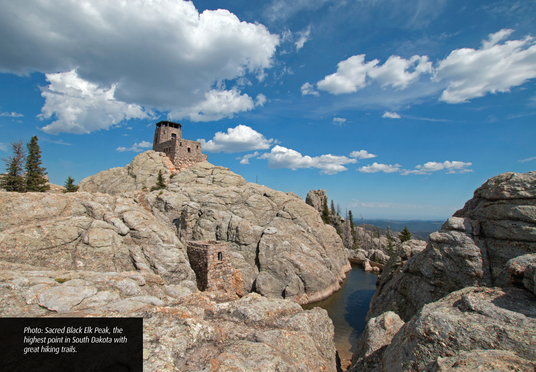
Photo: Sacred Black Elk Peak, the highest point in South Dakota with great hiking trails.