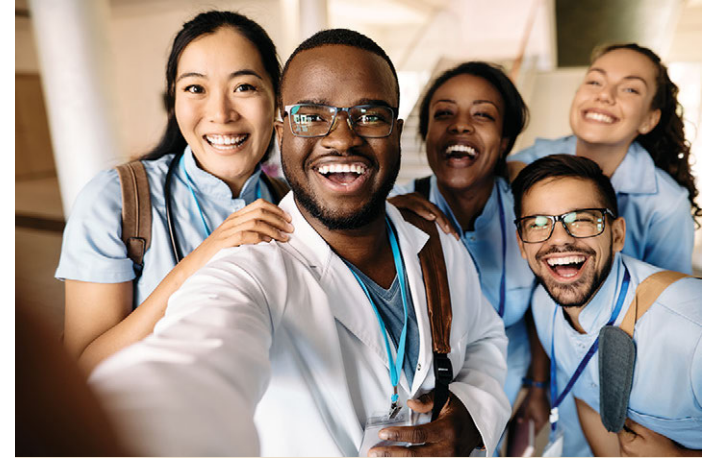
Photo right: Young health professionals are attracted to the financial freedom of the IHS LRP.

Did you know that you can pay off your health profession loans through our Loan Repayment Programs?