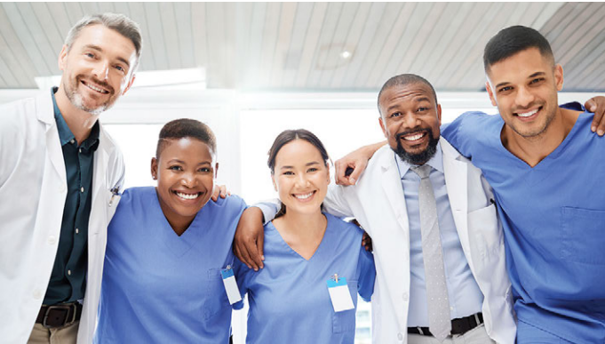
Photo Left: A young American Indian girl on an exam table while a nurse listens to her heart, a team of health professionals posing for the camera, two pharmacists smiling for the camera.

IHS offers a wide range of health profession opportunities in the Nashville Area. Enjoy a unique work/life balance that provides rich rewards and ample time for family and recreational activities.