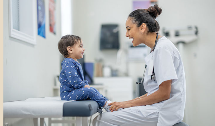
Photo Left: Niagara Falls. Right photos top to bottom: Toddler and doctor interact during a routine check-up, Catawba elder creating a hand-crafted turtle art piece, Cherokee Indian Hospital in Cherokee, NC.

The leadership and staff of the Nashville Area are dedicated to protecting and elevating the health status of the American Indian people they serve by consistently providing an efficient, collaborative system of medically appropriate, preventive, therapeutic, consultative and educational activities. This system, which advocates and enhances self-determination, is tailored to the unique cultures and diverse needs of each Tribe, and is delivered through qualified health care administrators and service providers.