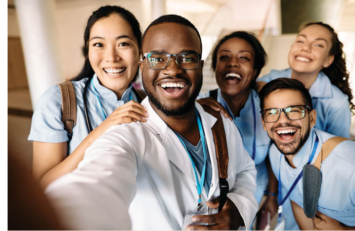
Photo right: Young health professionals are attracted to the financial freedom of the IHS LRP.

Did you know that you can pay off your health profession loans through our Loan Repayment Programs?