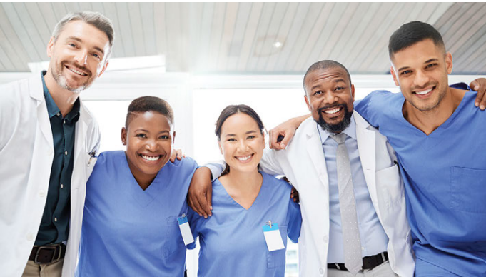
Photo Left: A young American Indian girl on an exam table while a nurse listens to her heart, a team of health professionals posing for the camera, Optometrist helps a young girl.

IHS offers a wide range of health profession opportunities in the Phoenix Area. Enjoy a unique work/life balance that provides rich rewards and ample time for family and recreational activities.