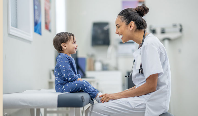
Photo Left: IHS health professionals with a young patient. Right photos top to bottom: Toddler and doctor interact during a routine check-up, dental team with a young patient and pharmacists posing for a picture.

The two Regional Youth Treatment Centers, located in Sacaton, AZ and Wadsworth, NV, are accredited by the Joint Commission on Behavioral Health Standards and operate as one organization providing services in two locations. The Area's largest health care facility is the Phoenix Indian Medical Center (PIMC), located near downtown Phoenix. This Joint Commission accredited, 127-bed hospital employs nearly 1,200 clinical and professional staff who provide comprehensive, patient-centered care to both urban and rural Tribal members. In addition, PIMC professional staff travel throughout the tri-state Area to provide direct services, consultation and guidance to other IHS hospitals and health centers.