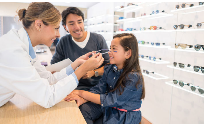
Photo Left: A young American Indian girl on an exam table while a nurse listens to her heart, a team of health professionals posing for the camera, Optometrist helps a young girl.