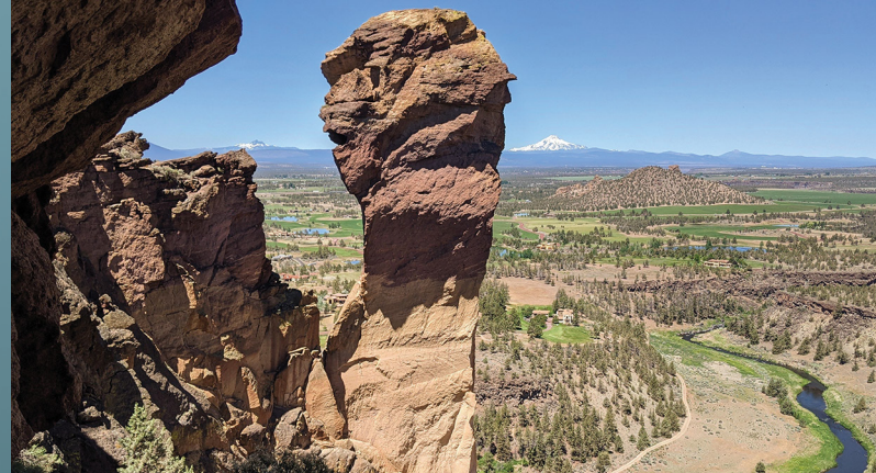
Photo Right: Stunning view of Smith Rock State Park in Terrebonne, OR.