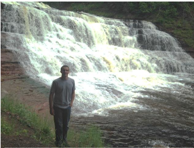
Agate Falls, Agate Falls Scenic site located in Ontonagon County, MI