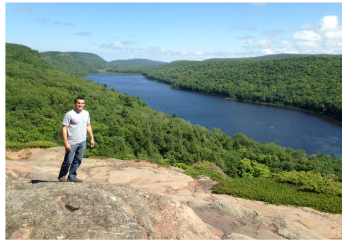
Lake of the Clouds located in the Porcupine Mountains Wilderness State Park