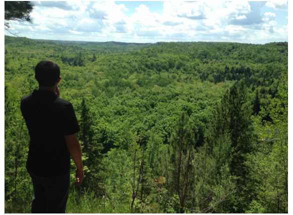
The Bears Den Overlook located in The Ottawa National Forest

My overall experience working with Indian Health Service has been outstanding. I was given the opportunity to work with knowledgeable, amazing people both with the IHS and those with the tribes. I believe that the hands-on experience and education gained through the Jr. COSTEP program is unattainable anywhere else. I would highly recommend this program for any individual looking for an internship that will challenge you to grow as a professional and as a student. I will cherish my experience with the Jr. COSTEP program for the rest of my life, and I thank the Indian Health Service for giving me such an amazing opportunity!