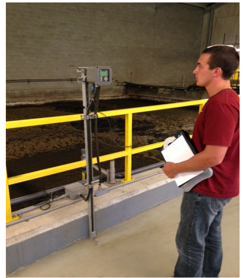
Inspecting Sequence Batch Reactor at a Wastewater Treatment plant