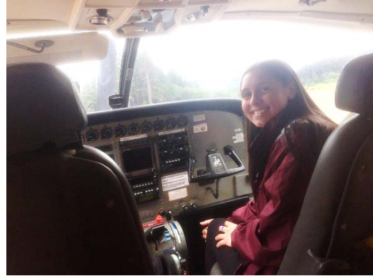
Traveling to Hoonah by seaplane