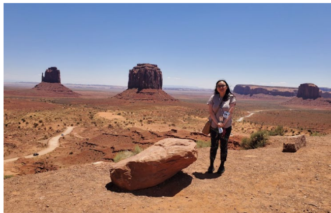
Visit to Monument Valley

If you're interested in working with rural, underserved communities, willing to learn and try out new things, and take on new roles and responsibilities, I would highly suggest this opportunity, especially with Navajo Area Office. This externship helped me develop professionally and see the tangible impacts when working to facilitate environmental health.