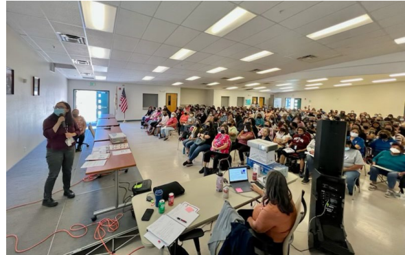
Presentation at Crystal Chapter House

One of the projects I had worked on involved creating a vector control related presentation in two days for Navajo Nation Head Start faculty and staff. It was exciting using my research and presentation knowledge for a public-facing audience, especially relating to vector control, environmental health, and pest management. I was able to learn more about integrated pest management, adapt the information available for Head Starts and childcare, and presented this project to 218 faculty and staff at Crystal Chapter House in Crystal, NM.