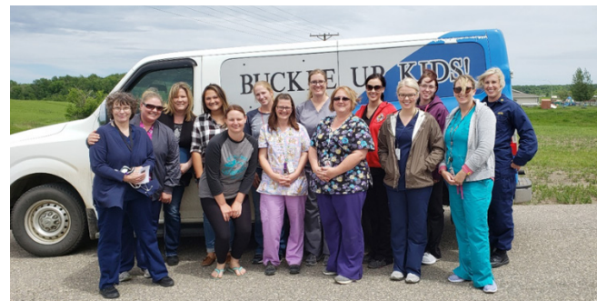
Participants who attended a car seat technician class.

The program has been able to provide car seat education in the homes through 19 nurses who are certified Technicians.