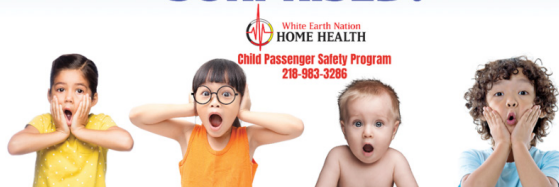
One of the car seat billboards on the White Earth Reservation.

3 OUT OF 4 CAR SEATS AREN'T USED CORRECTLY. SURPRISED?