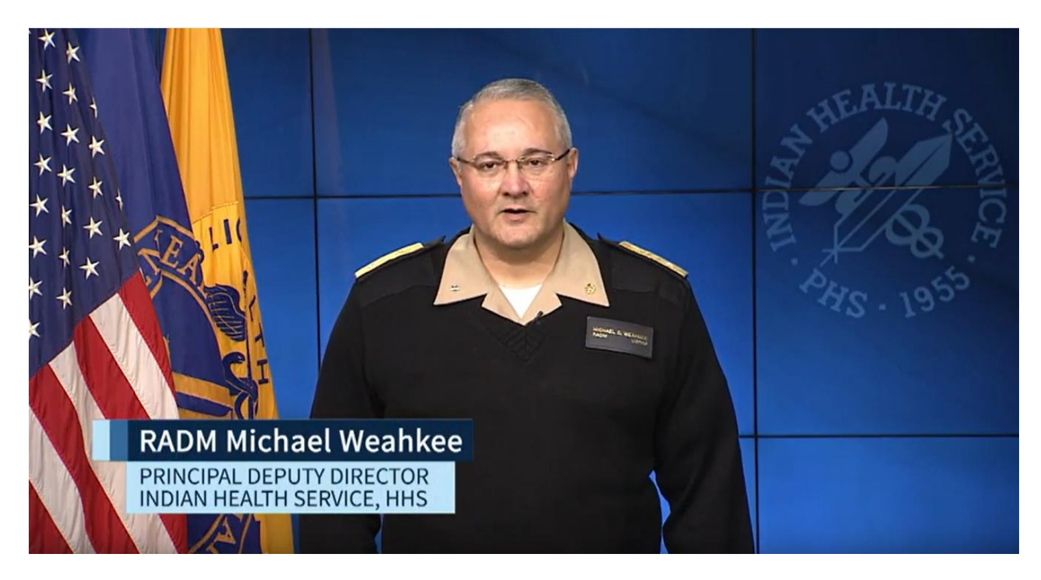
Click <u>here</u> for video