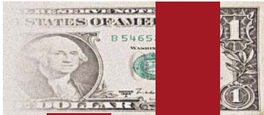
1955 - $35 Million

In 2005, the IHS appropriation was $3.77 billion, a 108-fold increase in 50 years. Of the total 2005 funding, $639 million (17 percent) was collected from Medicare, Medicaid, and private insurance. Counting both appropriations and collections, the IHS spending per person is estimated at $2,100 for personal health care services plus $500 for public health programs.