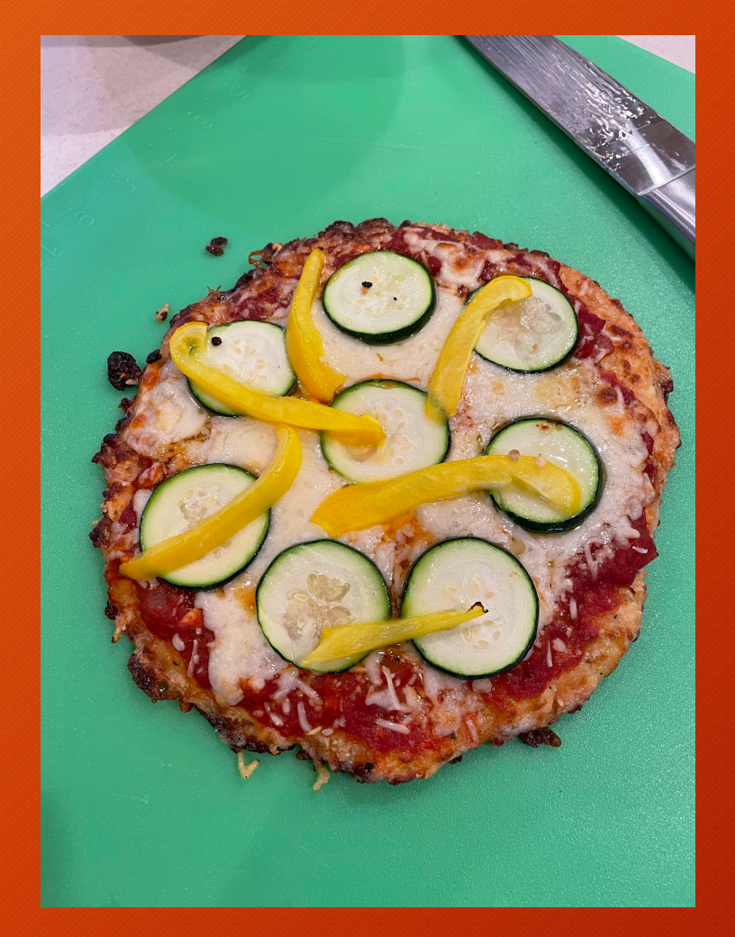
Cauliflower pizza at Senior Center