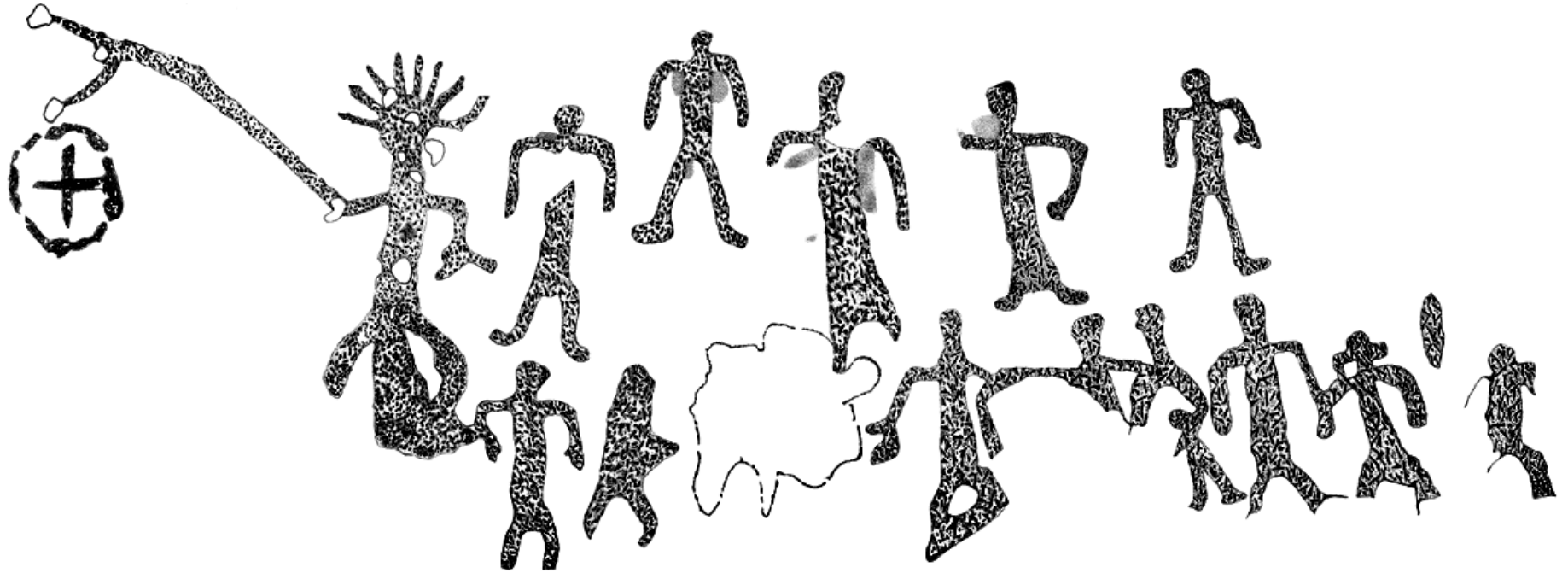
Rock Art (Univ. Arkansas)