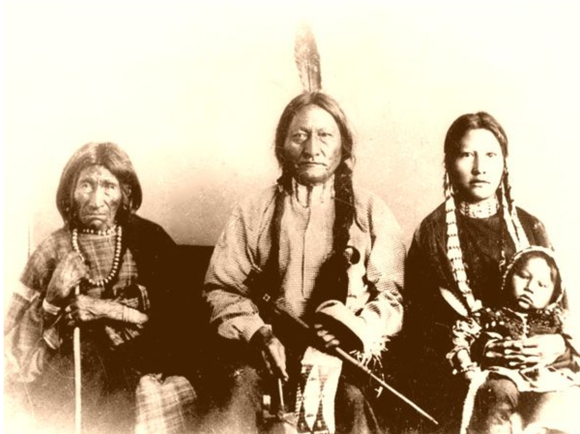
Tunkasila Tatanka Iyotake, Mother Her Holy Door, Daughter, and Grandchild